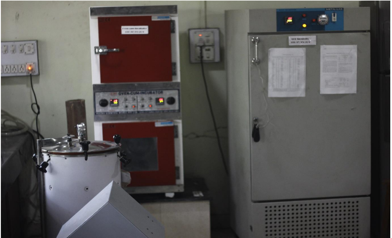
Auto Clave, Hot Air Oven cum Dryer and BOD Incubator