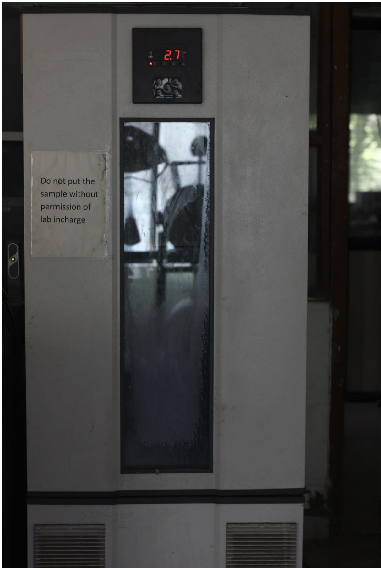
Deep Freezer (Temperature upto -4^{\circ}\text{C} )