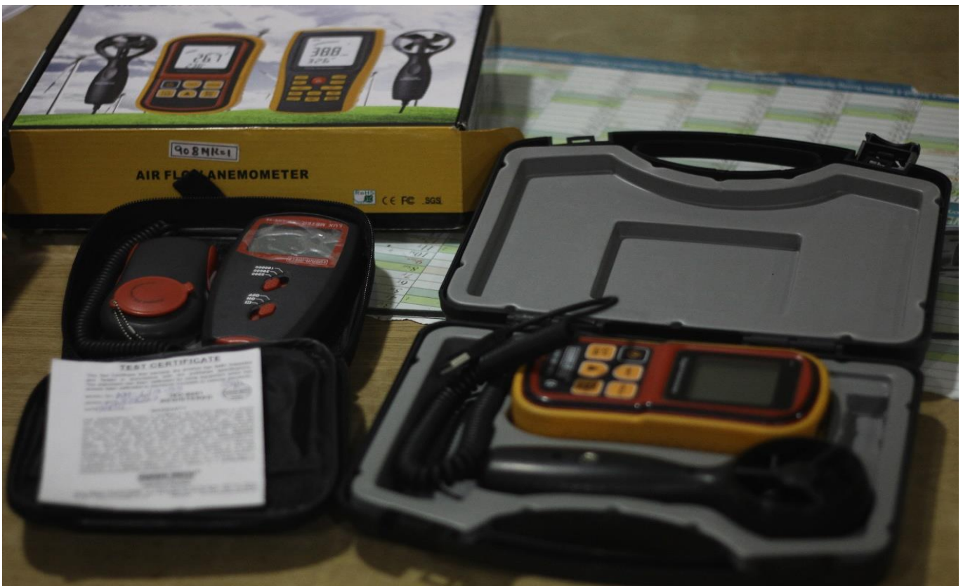
Air Flow Anemometer