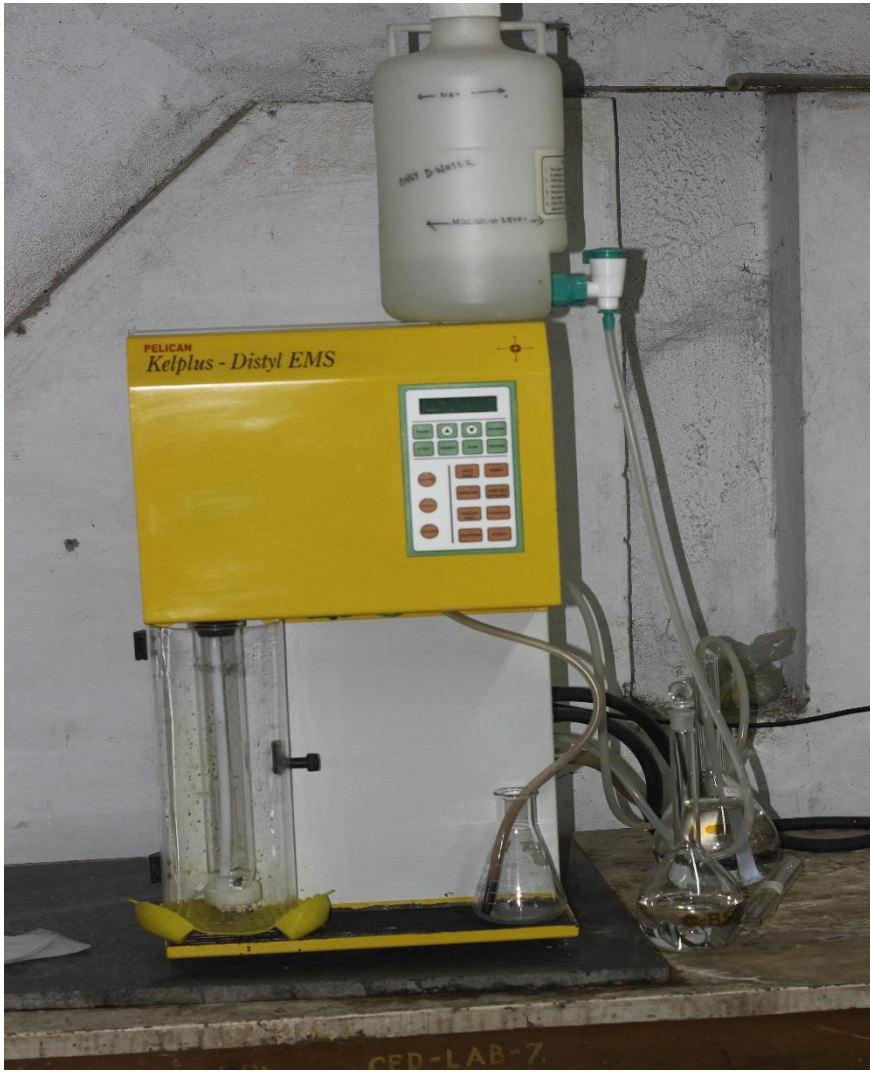
Total Kjeldahl Nitrogen Digester