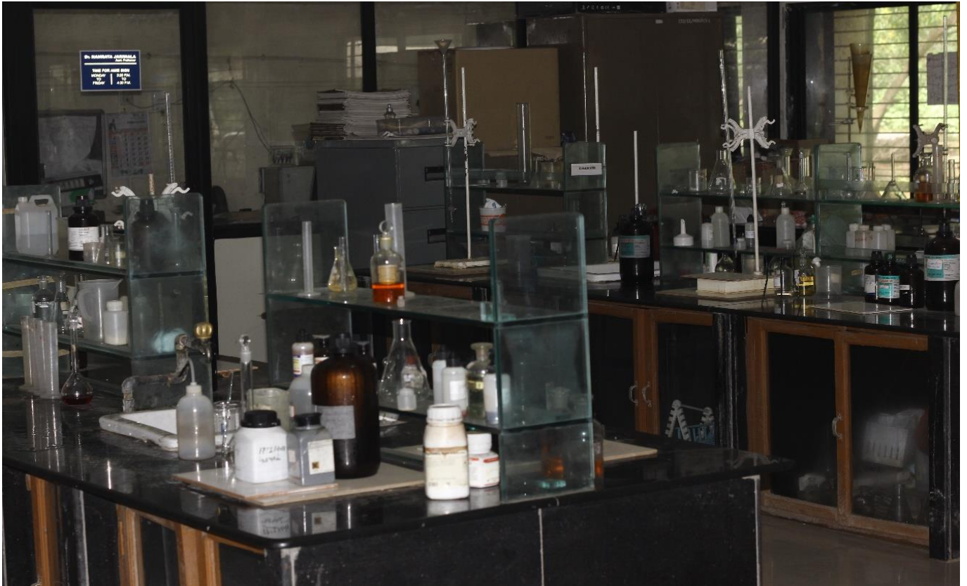
PHOTO GALLERY OF ENVIRONMENTAL ENGINEERING LABORATORIES