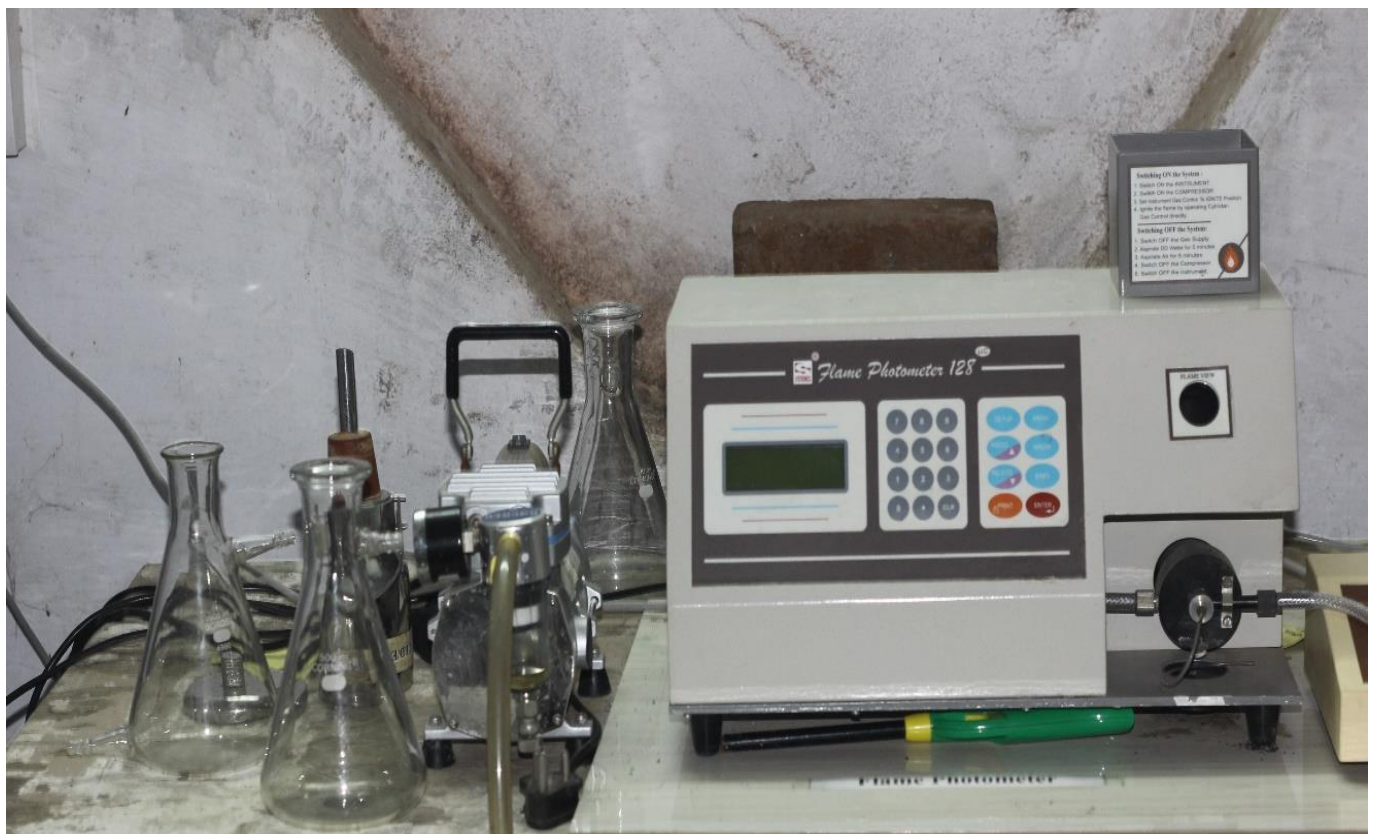
Suction Pump and Flame Photometer