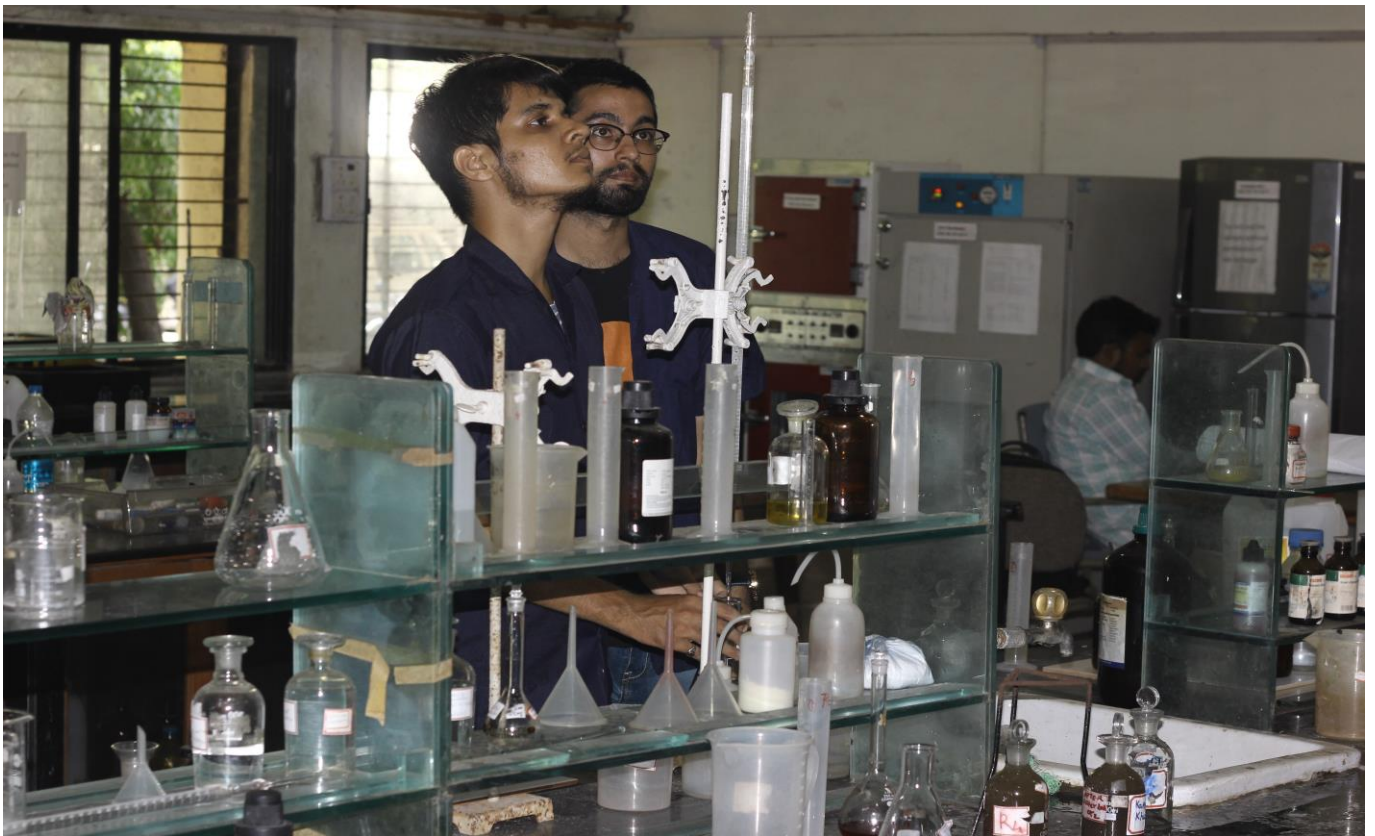
Environmental Engineering Laboratory